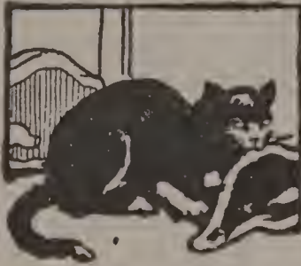
The Cat Picked the Choicest Meat.

J ACK and Evelyn used to often wonder why daddy never seemed to say anything about the traffic in the city. When they went to the city they were always at first afraid of all the noise and the quantities of cars and autos and trucks that moved so quickly along the streets.